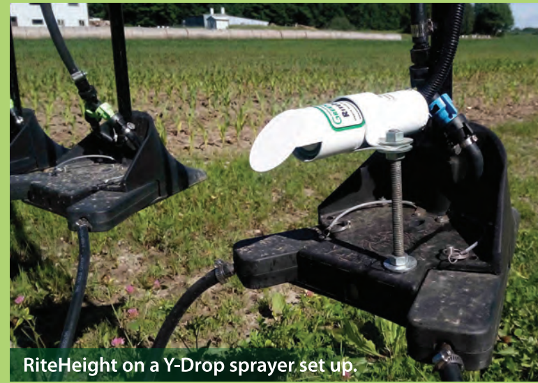
RiteHeight on a Y-Drop sprayer set up.

"I installed the 2-sensor RiteHeight system six seasons ago. No service or repairs needed since. Still works like new. I'm really pleased with it. Great value package!"