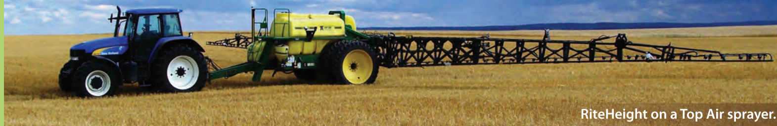
RiteHeight on a Top Air sprayer.

– Stan Peutert, Assiniboia, SK; Top Air sprayer, 120 ft