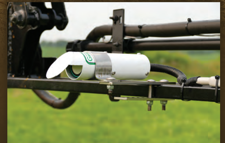
Compact sensor brackets allow for a variety of mounting options.