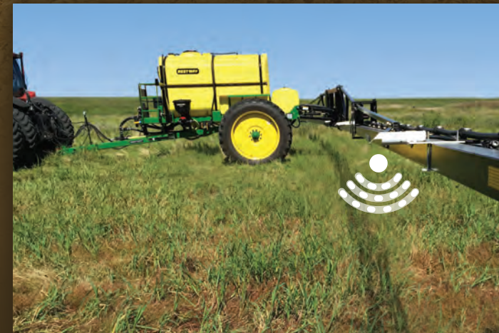
RiteHeight on a Bestway Fieldpro sprayer with 90ft boom.