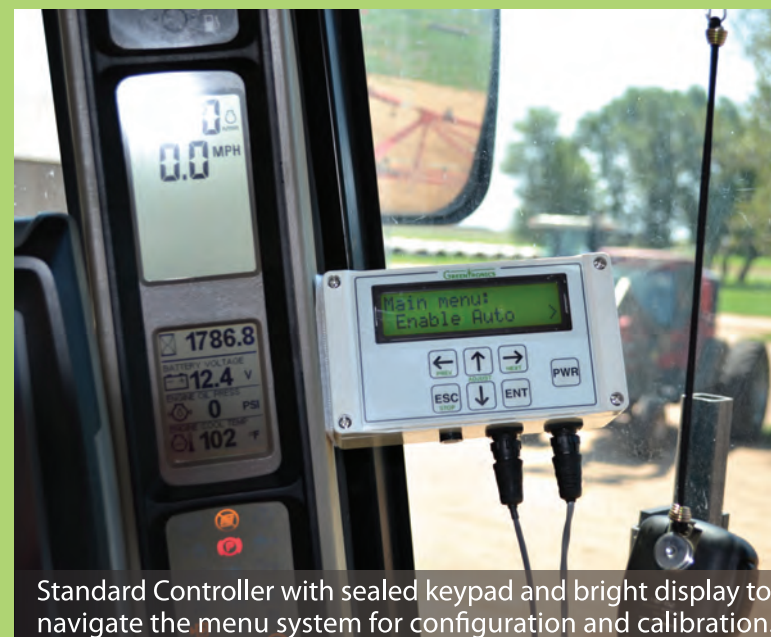
Standard Controller with sealed keypad and bright display to navigate the menu system for configuration and calibration.

– John Vanderlinde, Glencoe, ON; Rogator 664 with 120ft booms