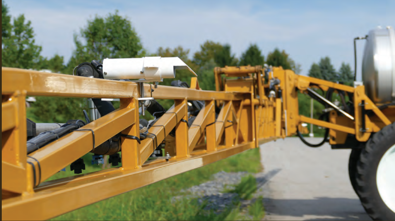
RiteHeight on a GVM Prowler sprayer