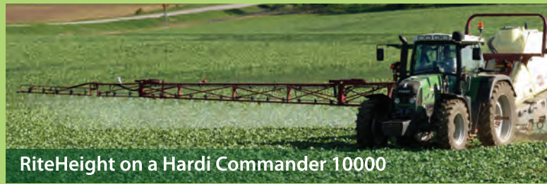
RiteHeight on a Hardi Commander 10000