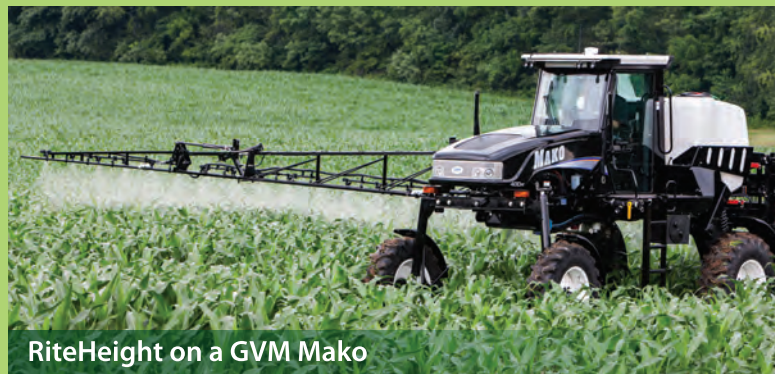
RiteHeight on a GVM Mako