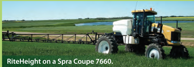
RiteHeight on a Spra Coupe 7660.